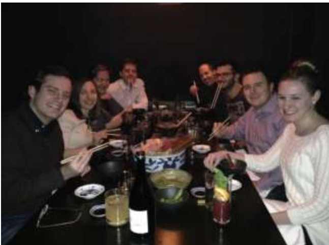
New York, New York!