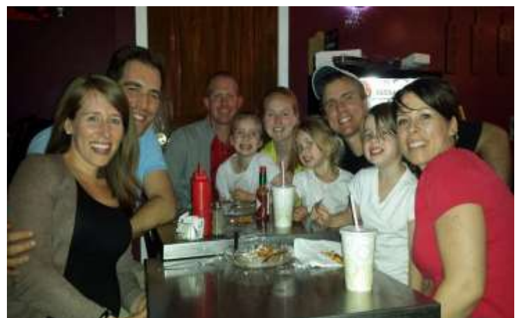
Pittsburgh, Round Two!