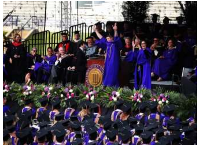
The final act!