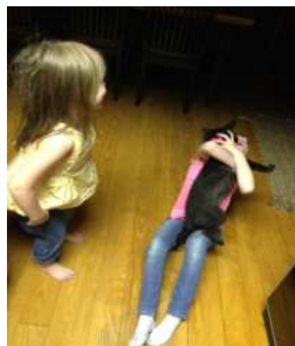
Extra retreat activity: kitty crushing